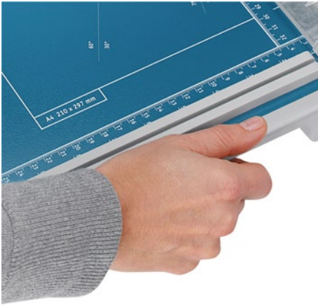
Practical recessed grips