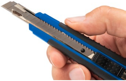
Dahle cutting instruments