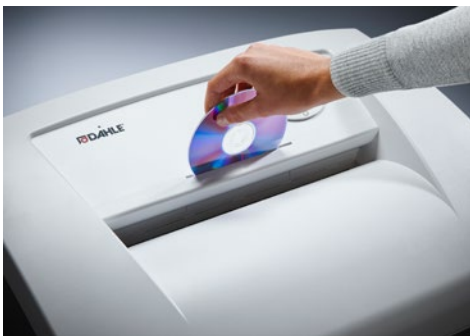
Dahle Waste 210air document shredder