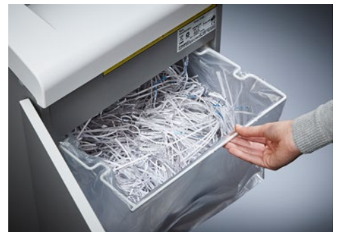
Dahle Waste 210air document shredder