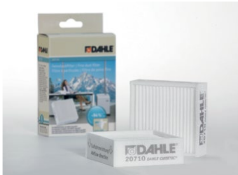
Dahle 20710 fine dust filter