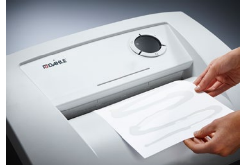
Dahle Waste 210air document shredder