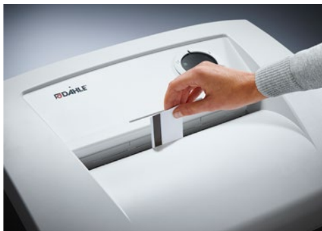
Dahle Waste 210air document shredder