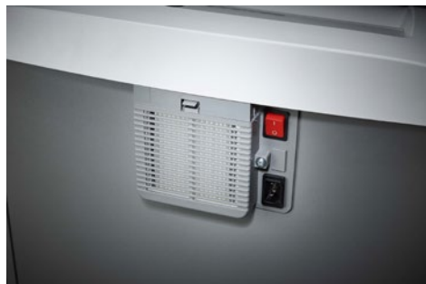
Dahle Waste 116air document shredder