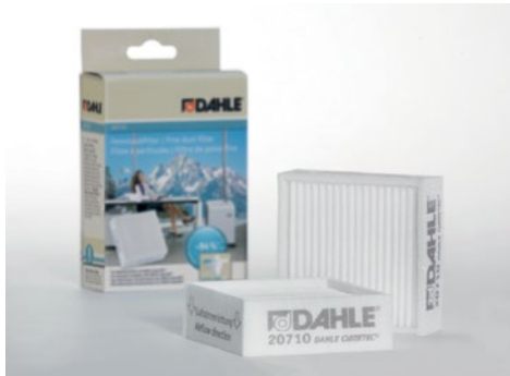
Dahle 20710 fine dust filter