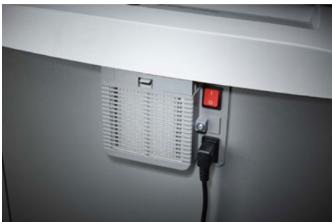
Dahle Waste 116air document shredder