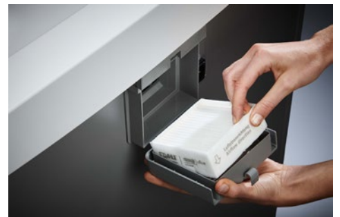
Dahle Waste 116air document shredder