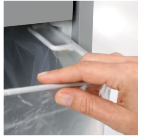
Pull-out rounded top frame that's kind on the fingers when changing the waste bag