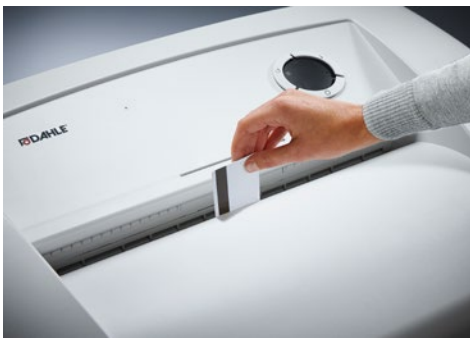
Dahle Waste 116air document shredder