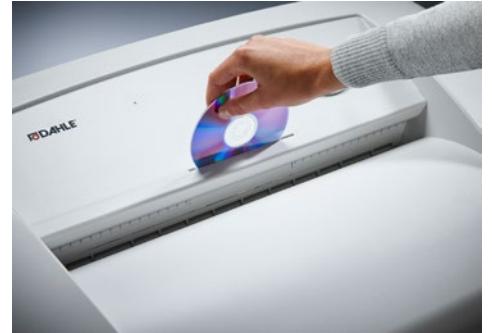
Dahle Waste 116air document shredder