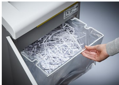
Dahle Waste 116air document shredder