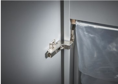
Dahle Waste 116air document shredder