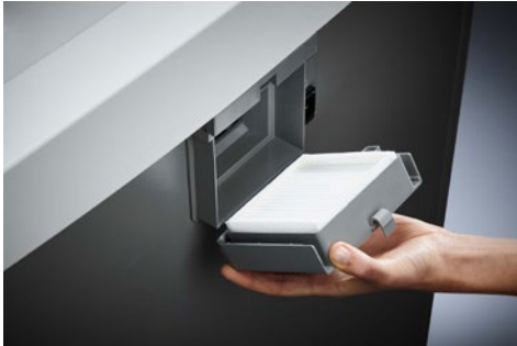
Dahle Waste 116air document shredder