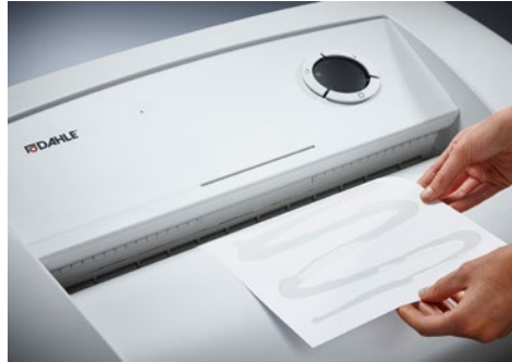
Dahle Waste 116air document shredder