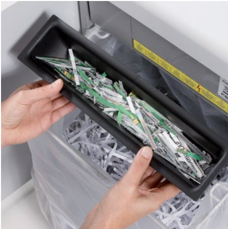
Separate, integrated waste boxes help to sort shredded paper, CDs, DVDs, cheque and credit cards for eco-friendly recycling