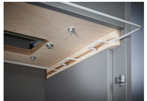
Dahle Waste 116air document shredder