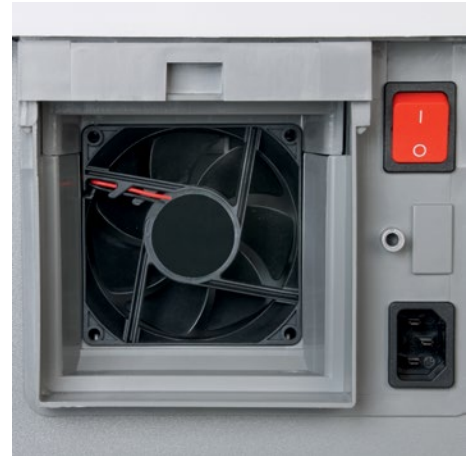
Powerful fan sucks in fine dust particles inside the document shredder and feeds them to the filter